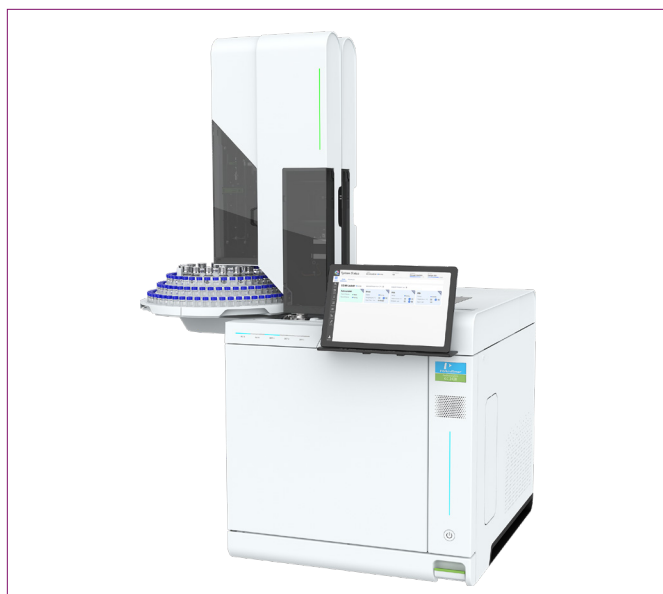
Figure 1: PerkinElmer GC 2400 System.

The PerkinElmer GC 2400 System, coupled with a packed column injector and a 12% G13 SS packed column on S1NS support provides a robust sample introduction system for the analysis. The GC 2400 System was configured with a PerkinElmer AS 2400™ Liquid Sampler and a FID Detector enabling a reliable platform for quantifying EG and DG impurities in PEG. The PerkinElmer Simplicity Vision™, running on the detachable touchscreen or any PCs, enables real time monitoring, from any location on the same network, optimizing time and ultimately increasing productivity of the lab.