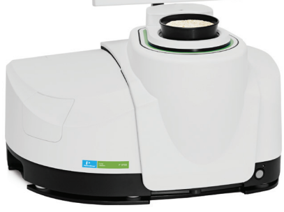
FT 9700 Full-Wavelength-Range FT-NIR Spectrometer