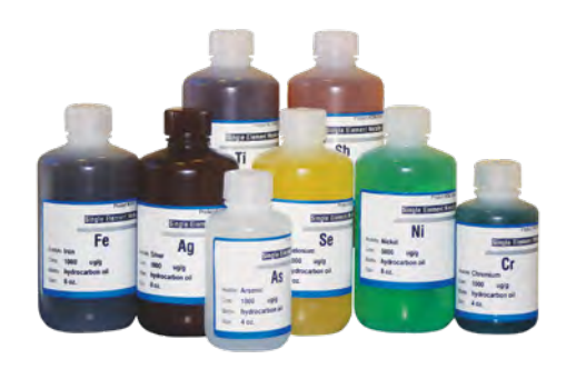
Certified Metallo-Organic Standards