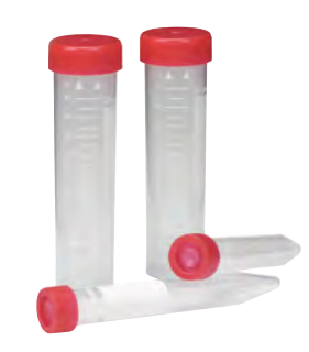
High Quality Autosampler Tubes