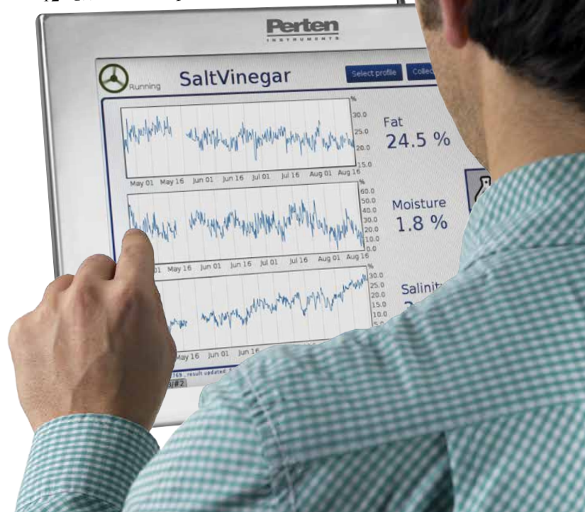
12" Touch screen Operator Interface

The junction box is typically mounted in the vicinity of the sensor and provides a convenient way to quickly install the required supplies to the sensor.