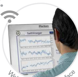
Web-based User Interface