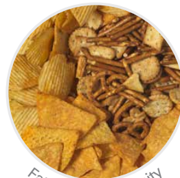
Fat, Moisture, Salinity