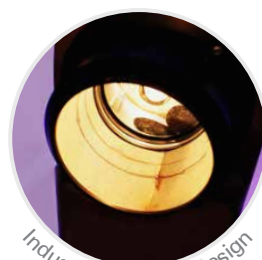
Industrial, Sanitary Design