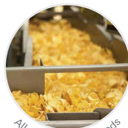
All types of Snack Foods