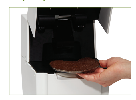
2. Analyze sample