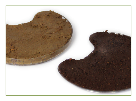
1. Prepare sample in dish

The DA 6200 uses NIR transmittance technology to analyze a large representative sample volume. Light is transmitted through the sample and collected on a linear array of diodes. NIR calibrations are then applied to the spectra with results available in just seconds. The calibrations are based on a wide range of olive types with varying levels of target parameters. The DA 6200 is a plug-and-play solution when equipped with ready-to-use global artificial neural networks (ANN) and partial least squares (PLS) calibrations.