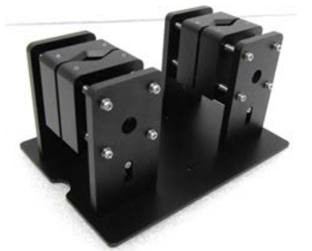
Figure 1 Lambda 365 Test Tube Holder [P/N: N4101018]