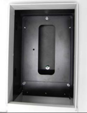
Figure 6 Pulling out the cell holder

3. Insert the test tube holder in the sample compartment and tighten the knob.