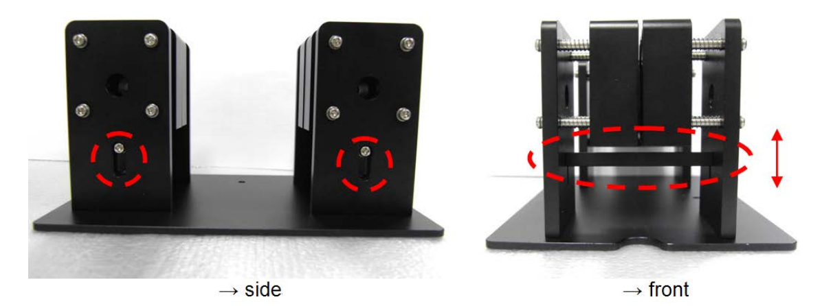
Figure 10 Controlling the height adjustment plate

1. To control the height adjustment plate, loosen the four screws by using a Phillips screwdriver.