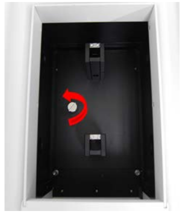
Figure 5 Loosening the knob

1. Loosen the knob to take apart the existing cell holder.