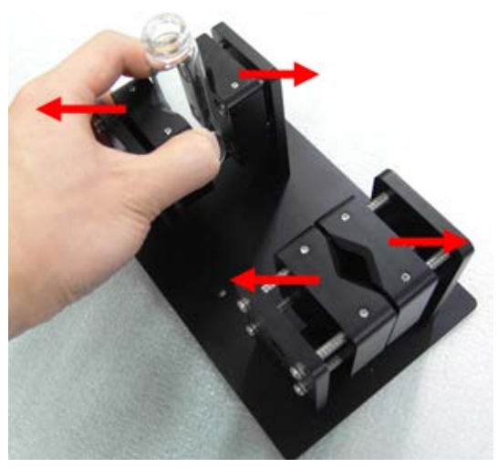
Figure 9 Inserting the test tube When the tube height is more than 105 mm

1. Insert the tube in the test tube holder.