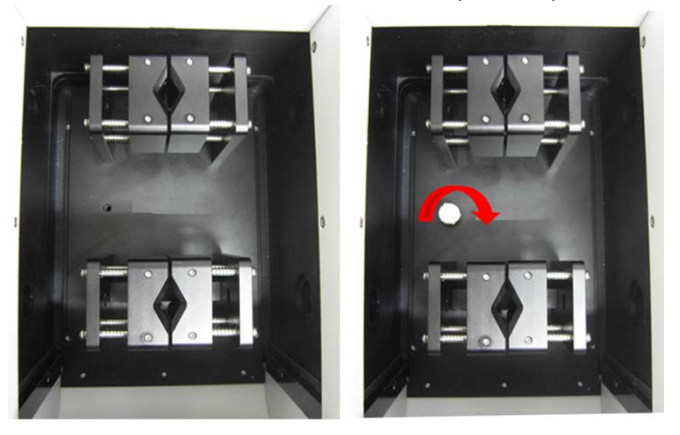
Figure 7 Inserting the test tube holder

3. Insert the test tube holder in the sample compartment and tighten the knob.