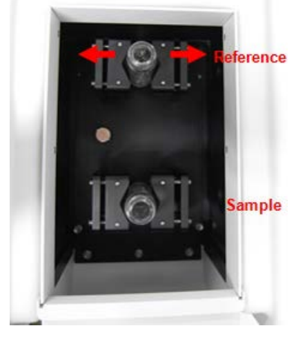
Figure 8 Inserting the test tube holder