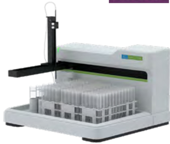
S20 autosampler series