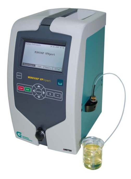
MINIVAP VPXpert - Expert vapor pressure testing at highest temperatures.

solution for testing vapor pressure of Gasoline-Ethanol blends at high temperatures. It allows for ramp measurements up to 120°C, providing the highest temperature range of vapor pressure testers on the market. Incorporating the world famous GRABNER vapor pressure test method, the analyzer complies with all industry vapor pressure testing standards, thus enabling safe development of the new generation automotive engines for Ethanol blended fuels.