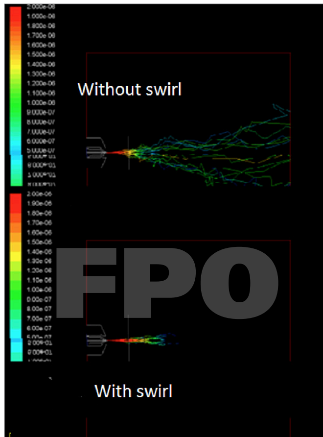
Figure 3. A simulation of droplet diameter vs source physical profile for swirl flow and flow without swirl for an identical distribution of drop diameters. Note the droplet motion simulation confirms that the effect of turbulence. Clearly, far fewer of the droplets remain unevaporated in the swirl case (far enough from the source).

Since the analyte is contained in the spray droplets, it is extremely important to evaporate as many droplets as possible to avoid analyte loss. The temperature profile of a swirling heated gas greatly helps to evaporate the typical-sized droplets. The direct simulation of the droplet motion shows that the turbulence damping assists to keep the droplets in the main flow in the high temperature region, providing improved droplet evaporation, especially at extended distances from the ion source.