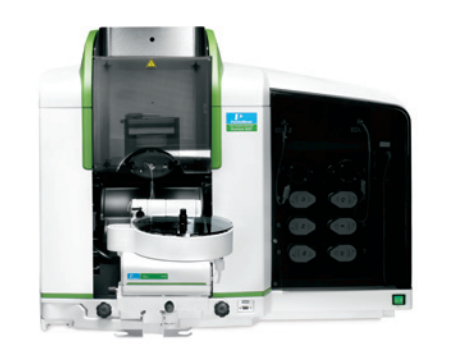
Figure 1. PerkinElmer PinAAcle 900T atomic absorption spectrophotometer equipped with AS 900 graphite furnace autosampler.

The measurements were performed using the PerkinElmer PinAAcle<sup>™</sup> 900T atomic absorption spectrophotometer (PerkinElmer, Inc., Shelton, CT, USA) (Figure 1) equipped with an AS 900 graphite furnace autosampler and WinLab32<sup>™</sup> for AA software running under Microsoft<sup>®</sup> Windows<sup>™</sup> 7 operating system.