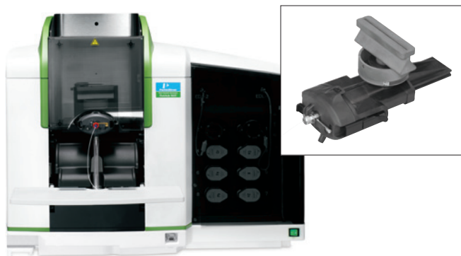
Figure 1. PerkinElmer PinAAcle 900T and quick change burner assembly with stainless steel nebulizer and air-acetylene burner head.

The analysis of a National Institute for Standards and Technology® (NIST®) Standard Reference Material (SRM) fuel oil was performed using a PerkinElmer® PinAAcle™ 900T spectrometer (Figure 1) operated in the flame mode. A stainless steel nebulizer (Part Nos. Nebulizer: N3160143; End Cap: N3160102) was used along with a solvent-resistant Kalrez® o-ring (Part No. N9300065) in the burner chamber and a solvent-resistant drain assembly. Hollow cathode lamps (Part Nos. V: N3050186, Ni: N3050152, Na: N3050148, Fe: N3050126) were used for all analyses and an air-acetylene flame was used for all elements except vanadium which was analyzed with a nitrous oxide-acetylene flame (Burner Head Part No. N0400100). Optimized parameters for each element are listed in Table 1.