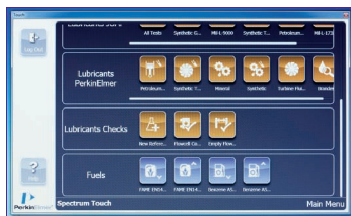
Touch App software provides intuitive operation.

Fuel industry-specific Touch App™ software launches recognised analysis methods at the touch of a button: FAME EN 14078 for biodiesel quantification and ASTM D6277 for benzene contamination. Touch App guides users through every step of the analysis, providing detailed on-screen instructions. A wizard-style interface steers operators to the result, while instructions for sampling minimise error. The software is also multi-touch enabled for a faster, more intuitive user experience. Unlike dedicated analysers, Spectrum Two also has the performance capability and sampling flexibility of a FT-IR and can be expanded to perform many other test methods.