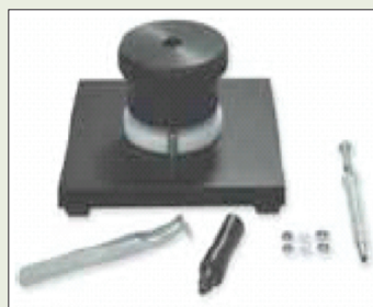
Figure 7. High-Pressure Capsule Sealing Tool.

10. 24 bar or 300 °C limits may not be enough for some applications such as polymerizations with by-product evolution, polymerization in water solutions or suspensions, study of water solutions at high temperatures or when we want to avoid decomposition of explosive samples. In these cases use the high pressure re-usable sample pans. These sample pans are practically a mini-autoclave, they include a base, a gasket and a cover, are available in stainless steel, stainless steel gold plated and titanium while gaskets are in gold plated stainless steel or in titanium. The internal volume is 30 microliters and they can resist an internal pressure of up to 150 bar. The high pressure pans are the only re-usable pans in our price list, all other pans are disposable, with the only exception of alumina and gold standard pans that can be cleaned and re-used. High pressure pans require the press B0182864 shown on Figure 7 while the part numbers of pans are listed on Figure 8. Please note that considering the mass of these pans, the heating rate should not exceed 20 °C/min.