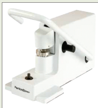
Figure 2. Universal Crimper Press. The Universal Crimper Press provides high quality pan sealing for the autosampler sample pans/ Hermetically sealed pans and can also crimp standard aluminum pans, large volume stainless steel (24 bar), and volatile pans. This is achieved simply by using the appropriate sealing insert. Includes sample pan suction tool and inserts to seal 10, 30, and 50 µL sample pans.