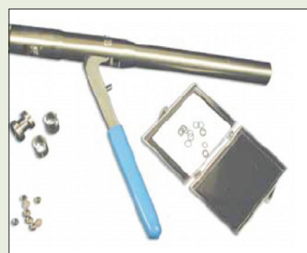
Figure 6. Large Volume Stainless Steel Capsule Kit. Part No. 03190021