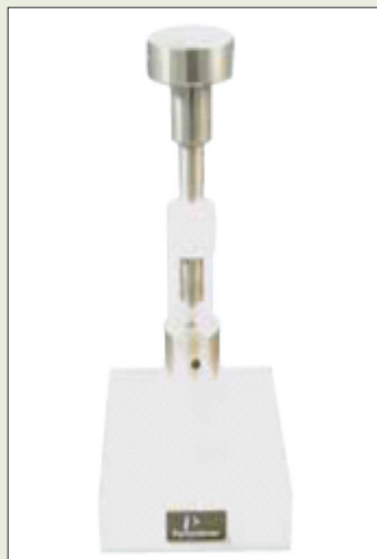
Figure 1. Standard Sample Pan Crimper Press. Used to crimp covers on standard DSC pans of aluminum, gold and copper. Design incorporates a replaceable crimper head. For use with Crimp Pans (02190041 and 03190026) and Replacement Crimper Head (02191171).