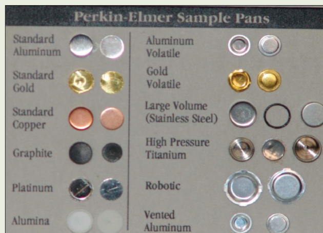
Figure 9. PerkinElmer sample pans.

Figure 9 above summarizes all of the available sample pans: please note that platinum pans and gold volatile pans are no longer available. As an alternative to platinum we can use copper, graphite or alumina.