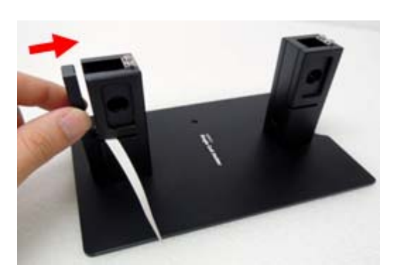
Figure 11 Inserting the stirrer head

4. Insert the stirrer head of the stirrer control cable into the single cell holder.