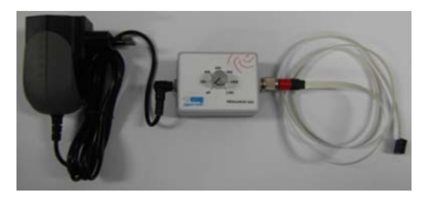
Figure 20 Connecting the stirrer control cable

2. Connect the stirrer control cable to the 4-pin socket of the control unit.