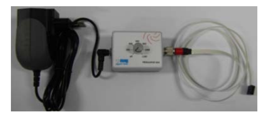
Figure 14 Connecting the stirrer control cable

2. Connect the stirrer control cable to the 4-pin socket of the control unit.