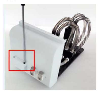
Figure 17 Detaching the Stirrer cable fixing block

7. After arranging the stirrer cable neatly, assemble the stirrer cable fixing block in the front cover using screw driver. Be careful that the stirrer cable does not block the light beam path to the cell holder.