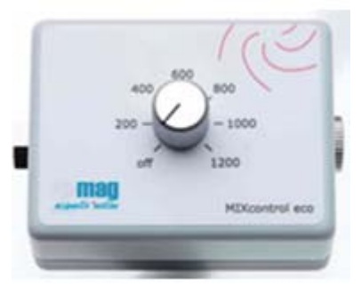
Figure 1 Magnetic Stirrer Control Unit [P/N: N4101015]