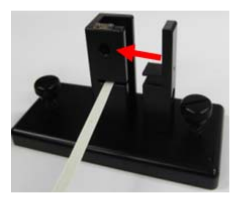
Figure 29 Tightening the screw

5. Assemble the single cell holder with the stirrer head inserted, and tighten the screw using the M3 wrench.