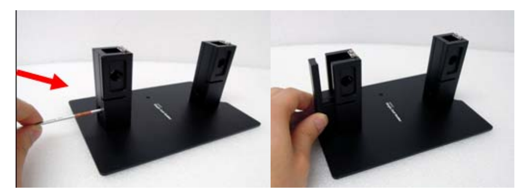
Figure 10 Removing the screw

3. Using the M3 wrench, remove the screw in the single cell holder and disassemble the holder.