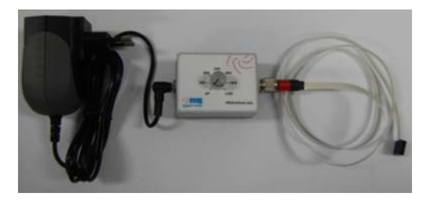
Figure 36 Connecting the stirrer control cable

2. Connect the stirrer control cable to the 4-pin socket of the control unit.