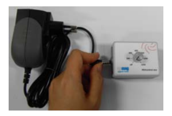
Figure 30 Connecting the plug of the power cable

1. Connect the plug of the power cable to the power input socket of the control unit.