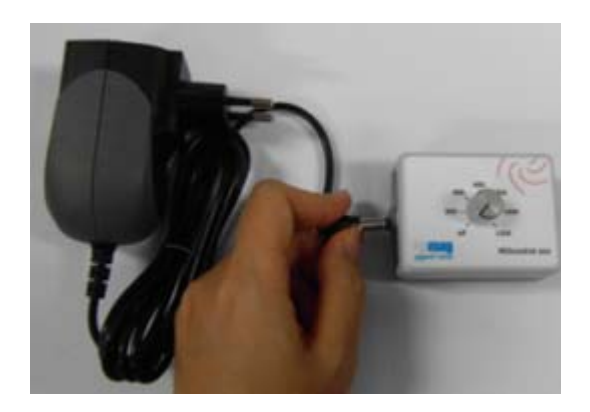
Figure 13 Connecting the plug

1. Connect the plug of the power cable to the power input socket of the control unit.