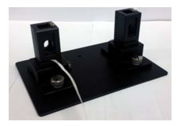
Figure 24 Tightening the screw

6. Tighten the screw using the M3 wrench and reassemble the micro cell holder to the base plate. Be careful that the stirrer cable does not block the light beam path to the cell holder.