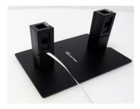
Figure 12 Assembling the single cell holder

5. Assemble the single cell holder with the stirrer head inserted, and tighten the screw using the M3 wrench.