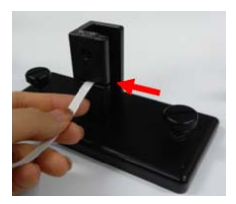
Figure 28 Inserting the stirrer

4. Insert the stirrer head of the stirrer control cable into the single cell holder.