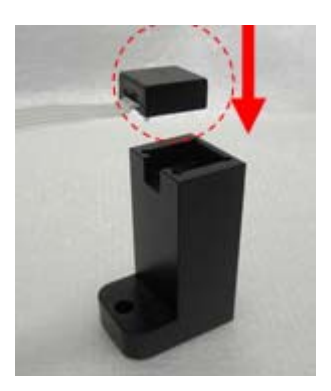
Figure 33 Placing the magnetic stirrer head on the stirrer mount

4. Place the magnetic stirrer head on the stirrer mount of the 8 cell water jacketed cell changer.