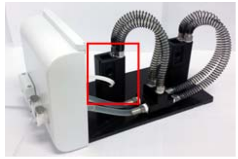
Figure 18 Assembling the Stirrer cable fixing block

7. After arranging the stirrer cable neatly, assemble the stirrer cable fixing block in the front cover using screw driver. Be careful that the stirrer cable does not block the light beam path to the cell holder.