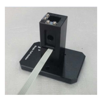
Figure 7 Assembling the single cell holder

5. Assemble the single cell holder with the stirrer head inserted, and tighten the screw using the M3 wrench.