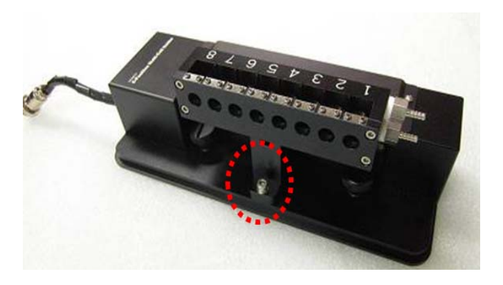
Figure 32 Removing the screw

3. Using the M4 wrench, remove the screw of the 8 cell water jacketed cell changer and disassemble the stirrer mount.