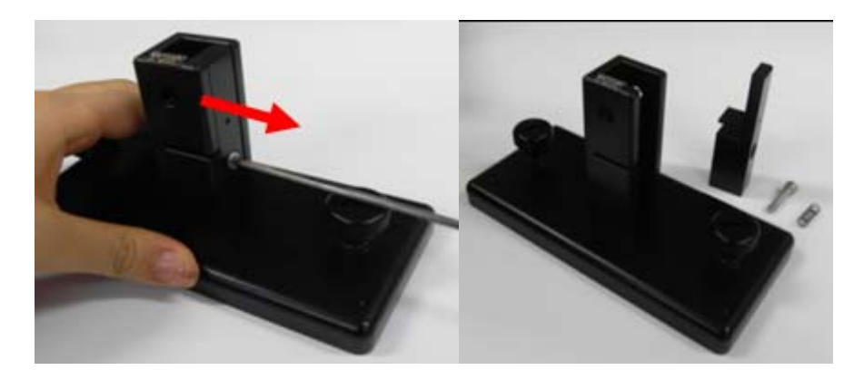
Figure 27 Removing the screw

3. Using the M3 wrench, remove the screw in the single cell holder and disassemble the holder.