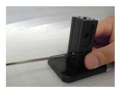
Figure 5 Removing the screw

3. Using the M3 wrench, remove the screw in the single cell holder and disassemble the holder.