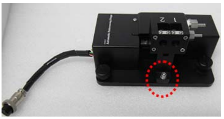
Figure 37 Removing the screw

3. Using the M4 wrench, remove the screw of the water jacketed automatic referencing stage and disassemble the stirrer mount.