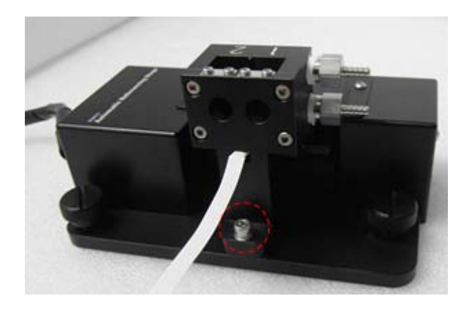
Figure 39 Fixing the stirrer mount

5. Fix the stirrer mount to the water jacketed referencing stage and tighten the screw using the M4 wrench.