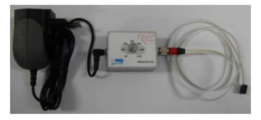
Figure 4 Connecting the stirrer control cable

2. Connect the stirrer control cable to the 4-pin socket of the control unit.