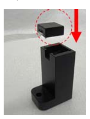
Figure 38 Placing the magnetic stirrer head on the stirrer mount

4. Place the magnetic stirrer head on the stirrer mount of the water jacketed automatic referencing stage.