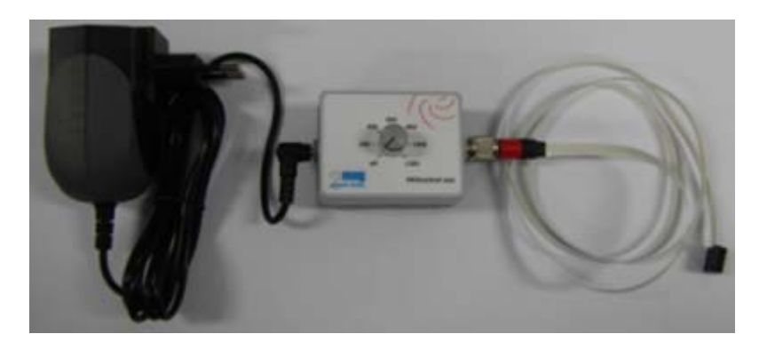
Figure 26 Connecting the stirrer control cable

2. Connect the stirrer control cable to the 4-pin socket of the control unit.