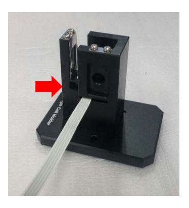
Figure 6 Inserting the stirrer head

4. Insert the stirrer head of the stirrer control cable into the single cell holder.