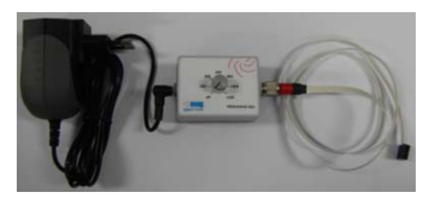
Figure 9 Connecting the stirrer control cable

2. Connect the stirrer control cable to the 4-pin socket of the control unit.