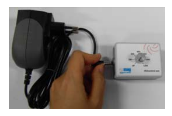
Figure 25 Connecting the plug of the power cable

1. Connect the plug of the power cable to the power input socket of the control unit.