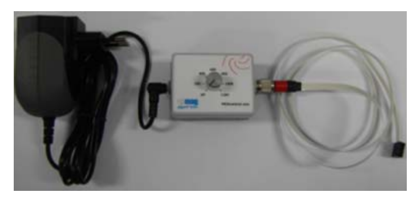
Figure 31 Connecting the stirrer control cable

2. Connect the stirrer control cable to the 4-pin socket of the control unit.