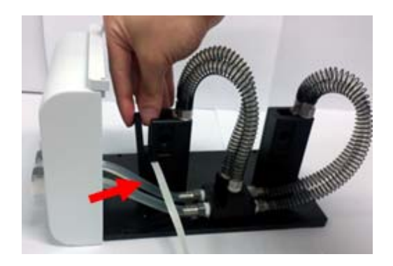
Figure 16 Inserting the stirrer head

4. Insert the stirrer head of the stirrer control cable into the water jacketed single cell holder.