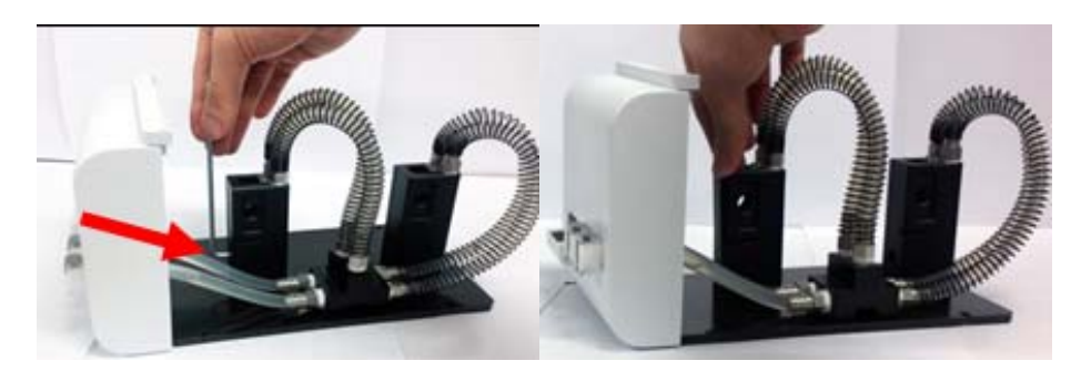
Figure 15 Removing the screw

3. Using the M3 wrench, remove the screw in the water jacketed single cell holder and disassemble the holder.