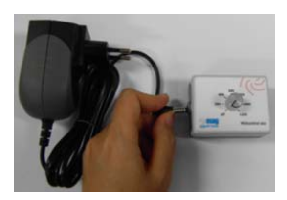
Figure 8 Connecting the plug

1. Connect the plug of the power cable to the power input socket of the control unit.