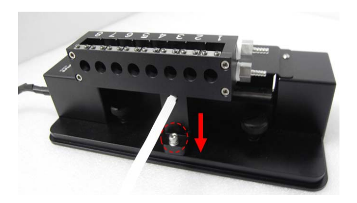
Figure 34 Fixing the stirrer mount

5. Fix the stirrer mount to the 8 cell water jacketed cell changer and tighten the screw using the M4 wrench.