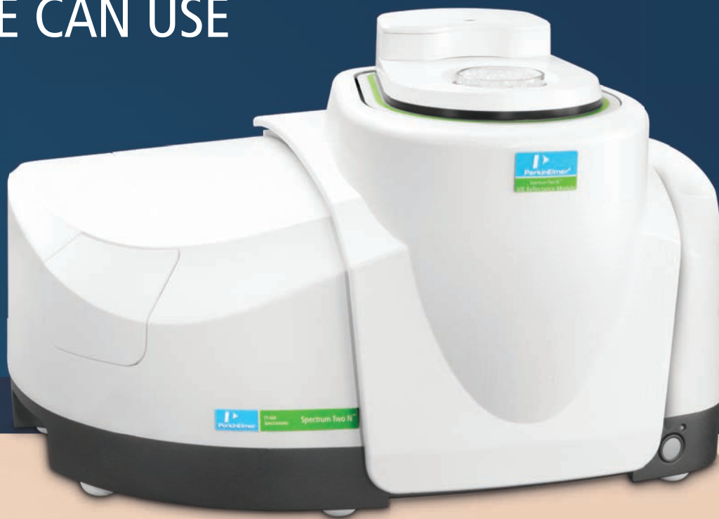
SPECTRUM TWO N