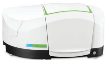
Spectrum Two N™ FT-NIR Spectrometer

For research use only. Not for use in diagnostic procedures.